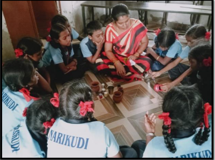
78 th Indian Independence Day Celebration