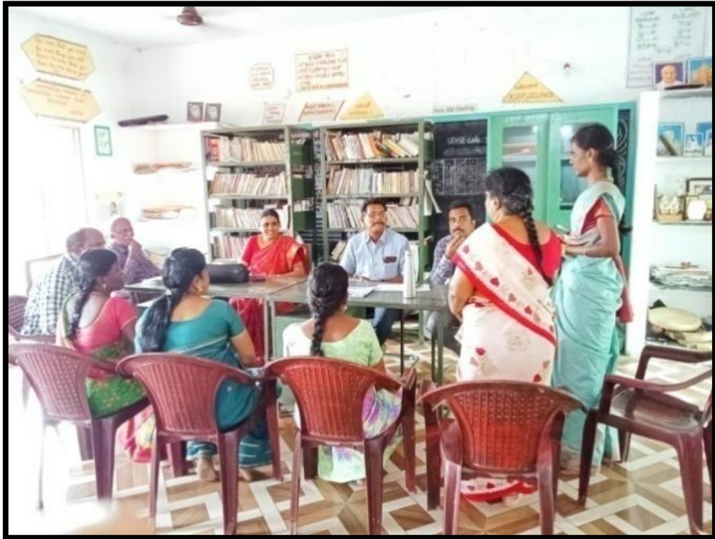
Team visit from Block Resource Center: