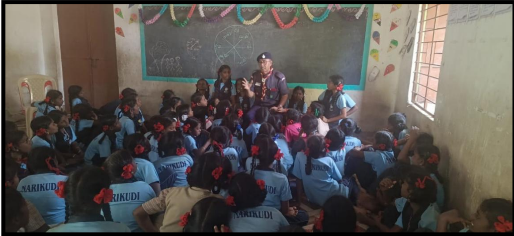
English hand-writing training: